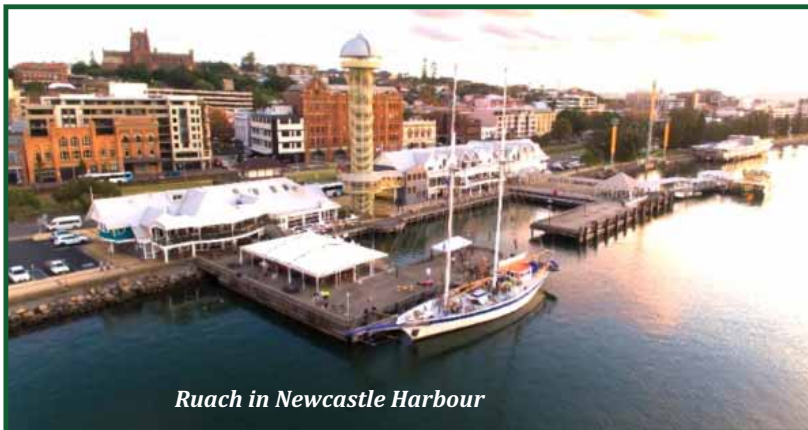
Ruach in Newcastle Harbour