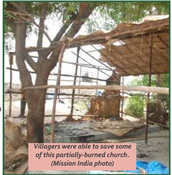
Villagers were able to save some of this partially-burned church.

1,500 miles away from that site in East India, a second church was also burned. The following morning after the fire, nothing remained of the building but bits of wood, ashes, carpet rags, and the rubble of what used to be musical instruments. The pastor of this church oversees a class of Mission India Church Planters who are doing outreach among the families living on the nearby hills. As violence against Christians is on the rise in India, pray for their safety. - mnnonline.com