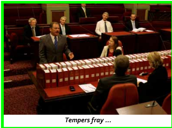
Tempers fray ...

CHRISTIAN Television Australia's Easter Special, An Innocent Man? which will screen on the Seven Network at 3pm on Good Friday, is a dramatic recreation of the events of the first Easter.